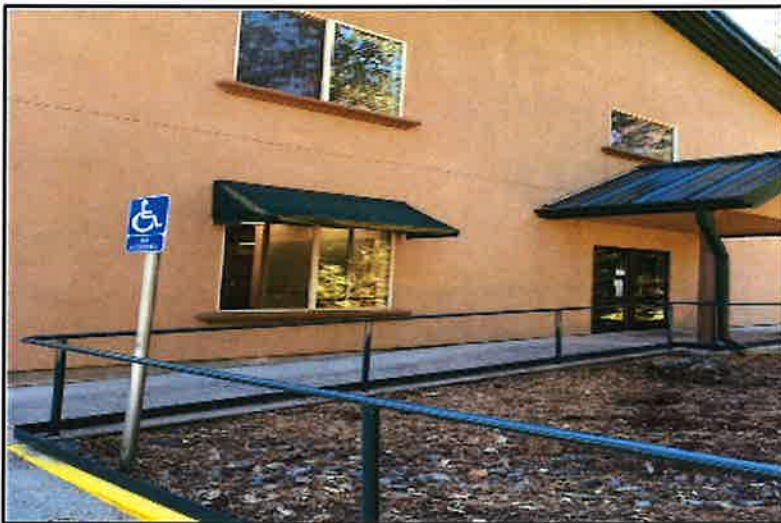
Administrative Office 17020 Placer Hills Rd. Meadow Vista, CA 95722 Mailing address P.O. 350 Meadow Vista, CA 95722