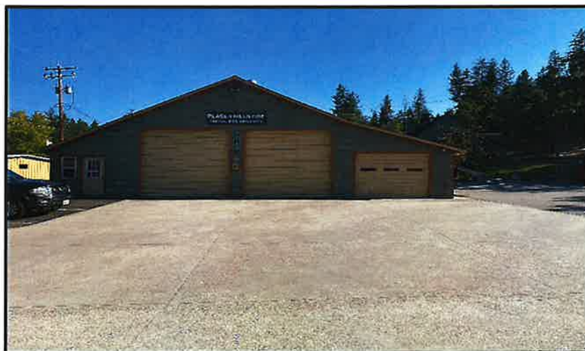
Placer Hills Fire Protection District Station #85- Daily staffing, Fire Mechanic/Fire Captain 18016 Applegate Rd Applegate, CA 95703