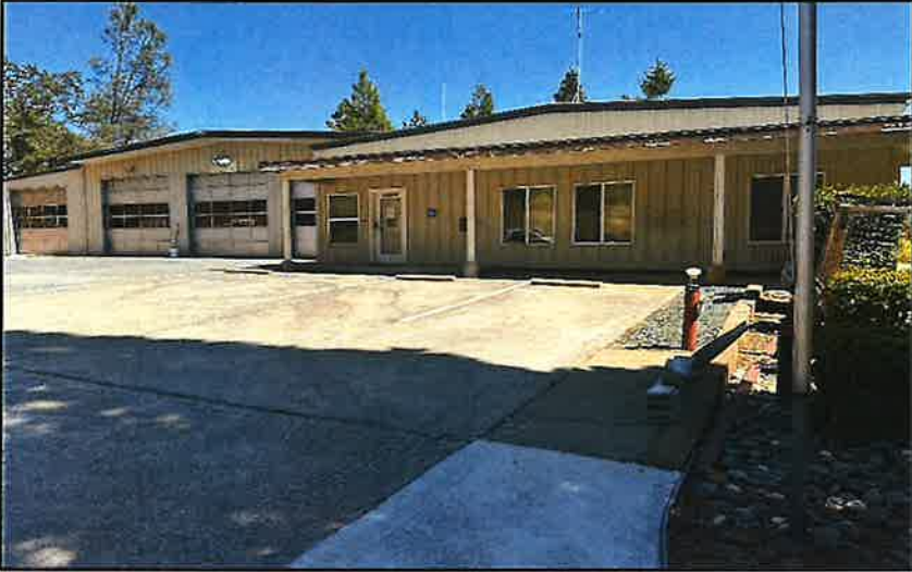
Placer Hills Fire Protection District Station #86- 24/7 staffing, paramedic 100 W. Weimar Cross Rd Weimar, CA 95736