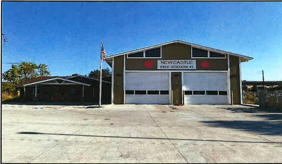
Newcastle Fire Protection District Station #41- 24/7 staffing 9350 Old State Highway Newcastle, CA 95658