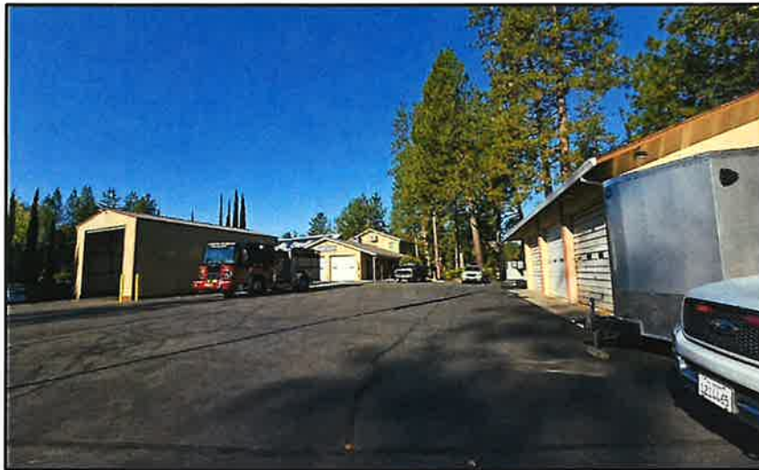
Placer Hills Fire Protection District Station #84- 24/7 staffing, paramedic 16999 Placer Hills Rd Meadow Vista, CA 95722